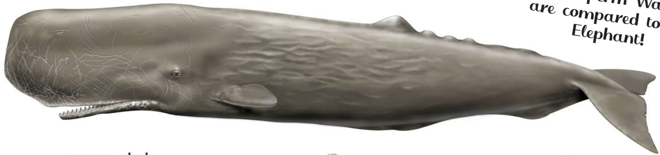
sperm whale ( Physeter catodon ) length up to 19 m (62 ft)

WOW! Look how BIG Sperm Whales are compared to the Elephant!